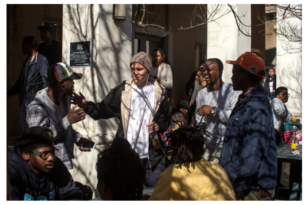
A cafeteria courtyard in the main campus of the University of Cape Town.

In March, a student threw excrement at a statue of Cecil Rhodes, the British imperialist who donated land to the university. Students here and elsewhere call their movement "Rhodes Must Fall."