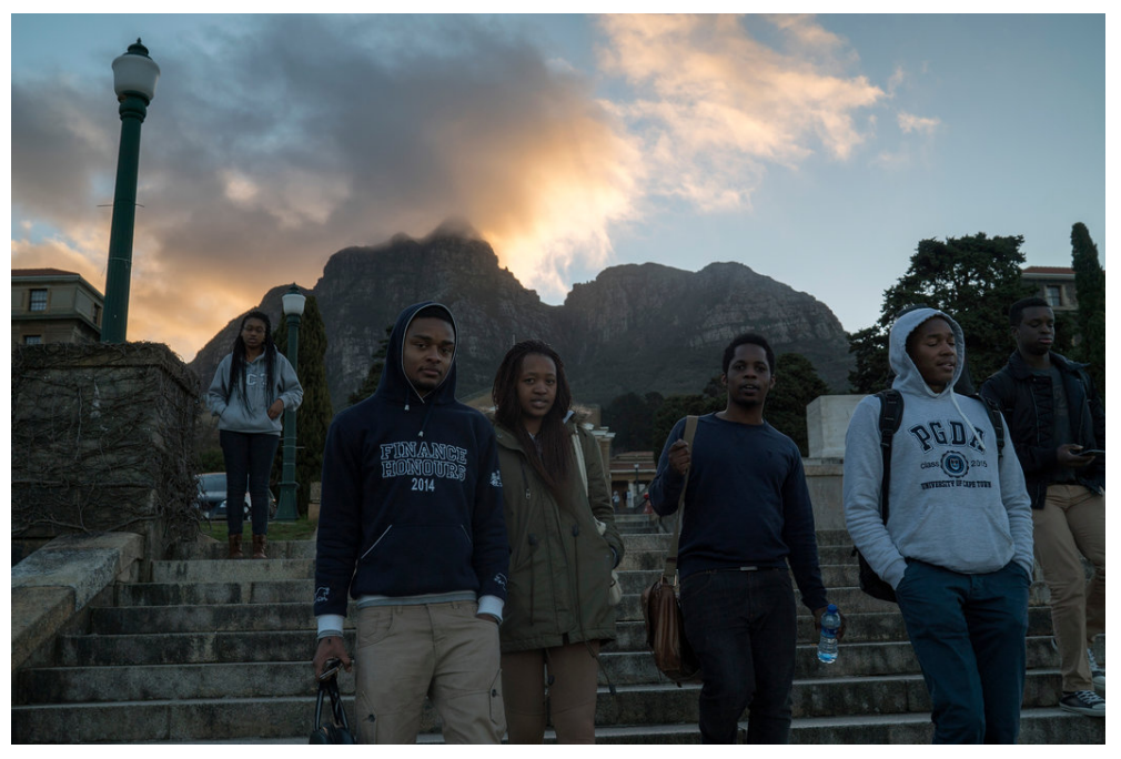
Students at the main campus of the University of Cape Town. Black South Africans make up 24 percent of the student body.